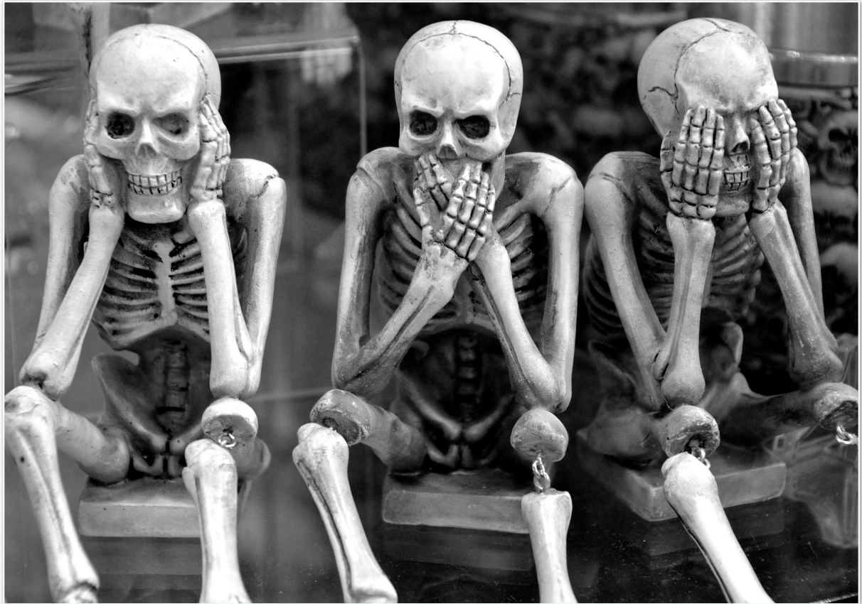
Power of 3 - You can only add three items to each processing box.